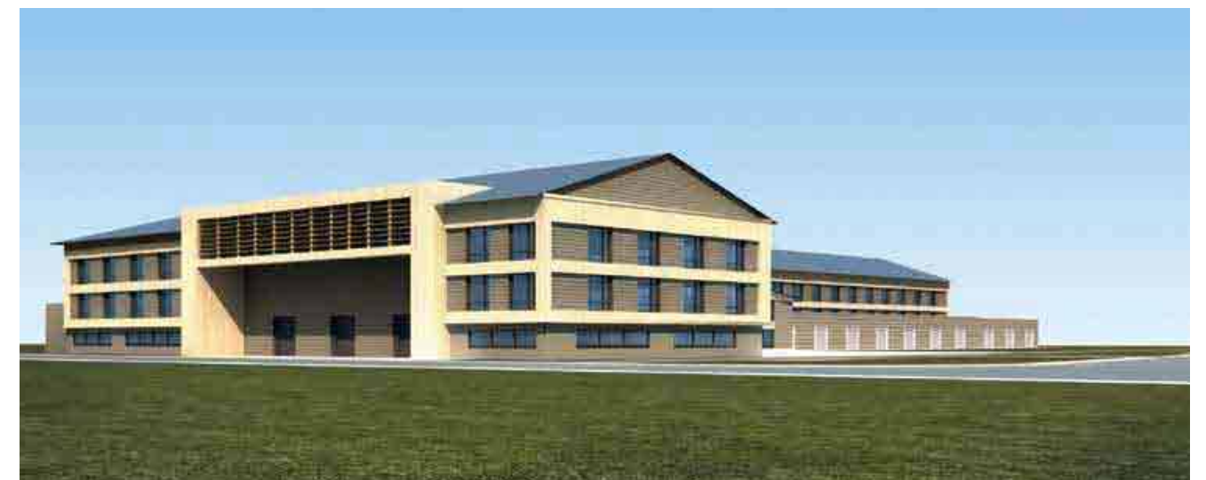
3D Visual (Artistic Impression)